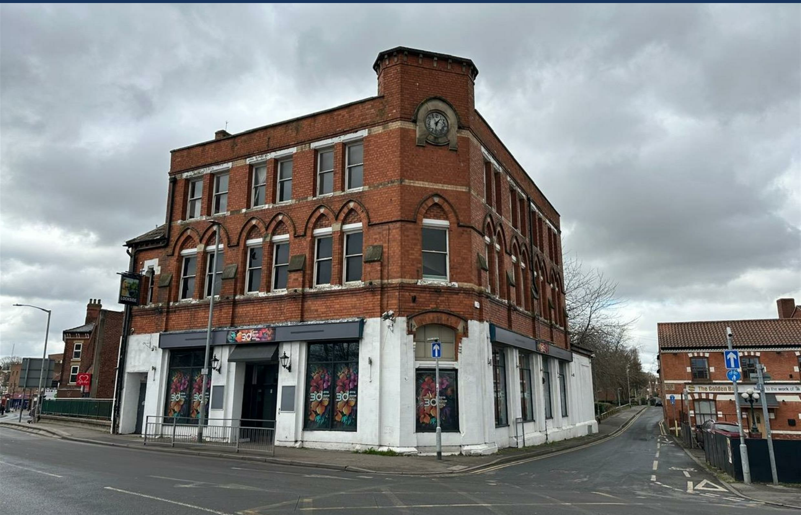
The Lockside, 1, Victoria Square Worksop, S80 1DX